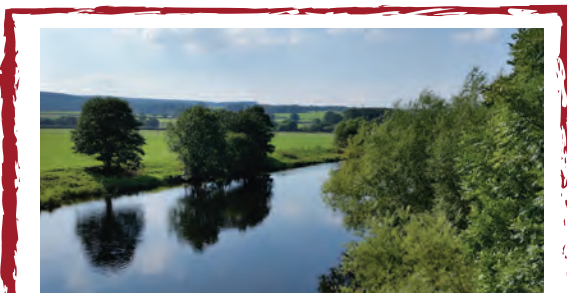
Trees and plants