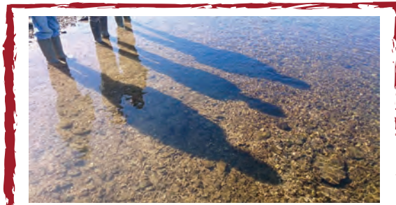
You and me